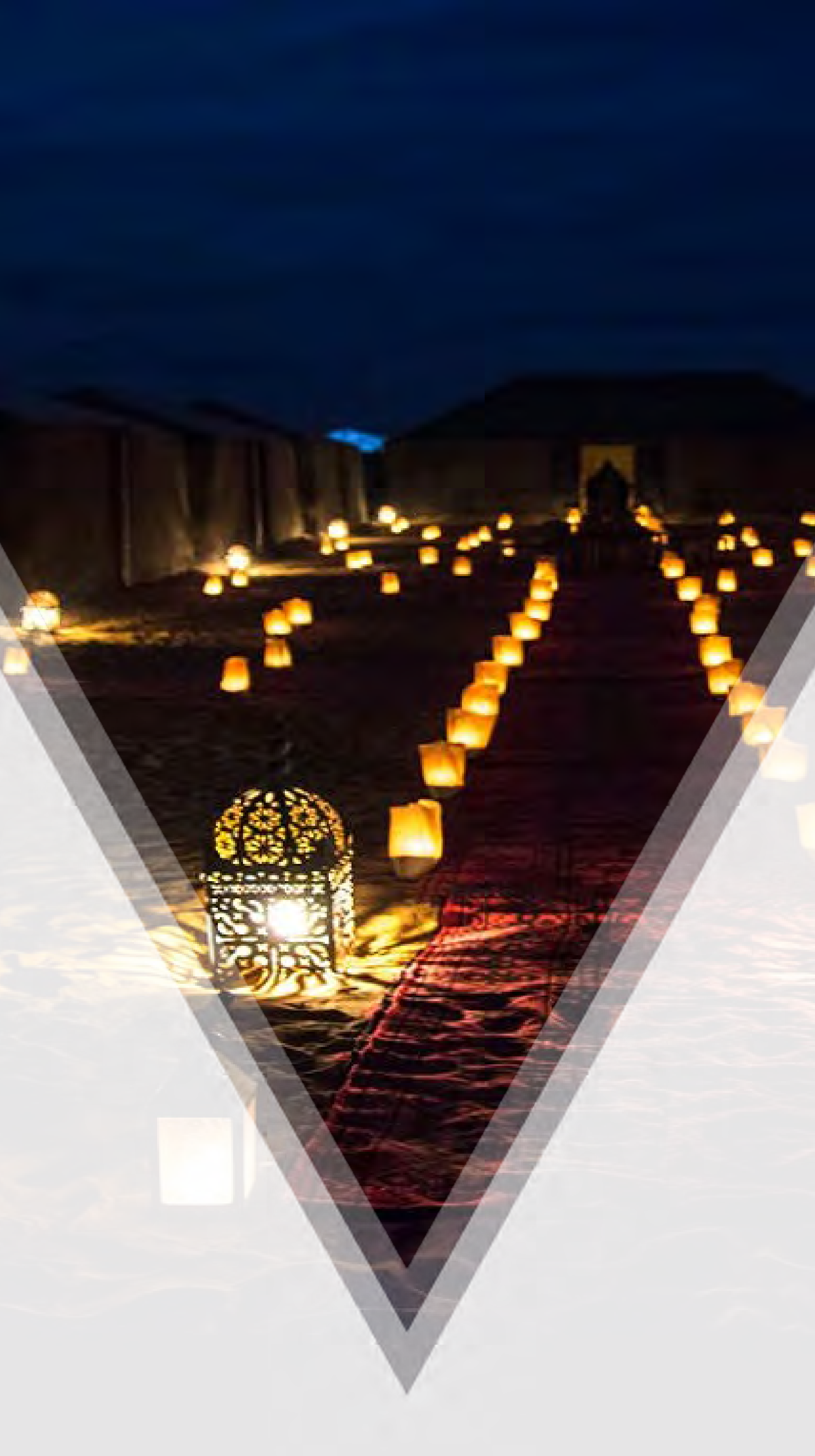
FEZ, GO CHIC...